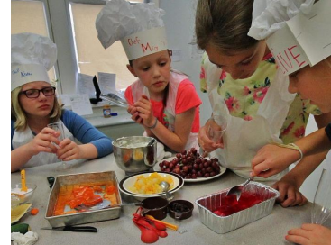
Eat With Your Eyes Cooking Camp MORE INFO