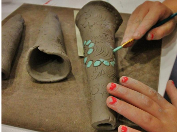
Ceramics Workshops For All Ages! MORE INFO