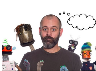
Introducing... Puppetry Camp! MORE INFO