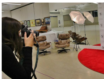
Photograph Like the Pros June 6-27 • 5:30-7:30 pm MORE INFO